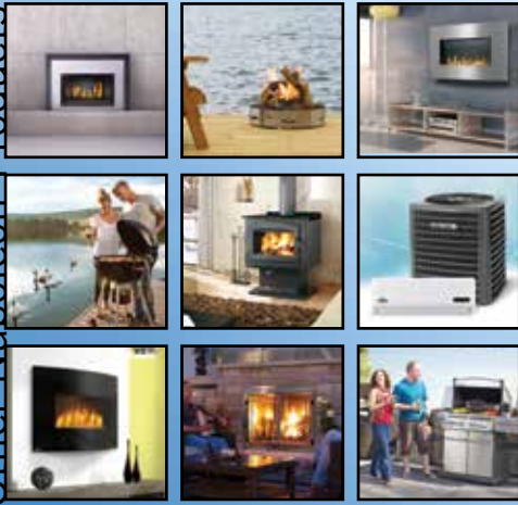
Fireplace Inserts • Patioflame • Gas Fireplaces • Charcoal Grills • Wood Stoves Heating & Cooling • Electric Fireplaces • Outdoor Fireplaces • Gas Grills